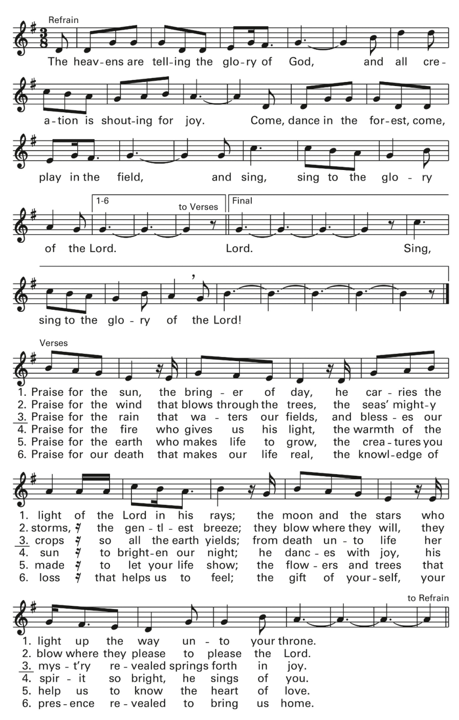
© 1980, GIA Publications, Inc. All rights reserved. Used with permission.