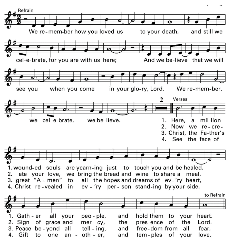
© 1980, G.I.A. Publications, Inc. All rights reserved. Used with permission.